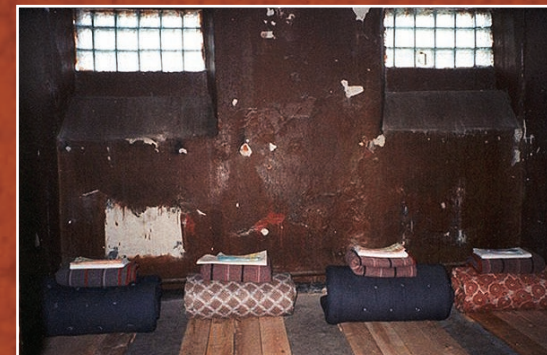
Beds consist of thin mattresses on hard boards.