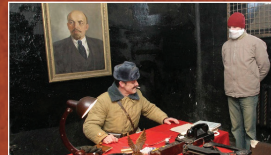
Interrogators traumatize guests beneath a portrait of Lenin.