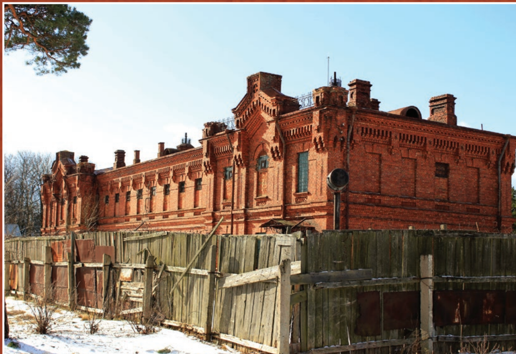
The dilapidated building is still surrounded by the same wall topped with barbed wire that once prevented inmates from escaping.